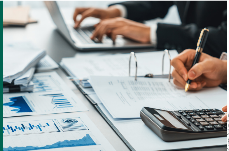
Moment Makers Group