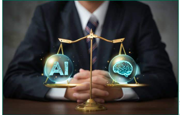
A valuation analyst must balance AI-powered data with sound professional judgment.

There also are significant concerns related to data privacy and security. Valuation analysts often are provided with proprietary financial data and internal company information. Improper management of this information could harm the company. If a valuation analyst introduces sensitive or confidential company