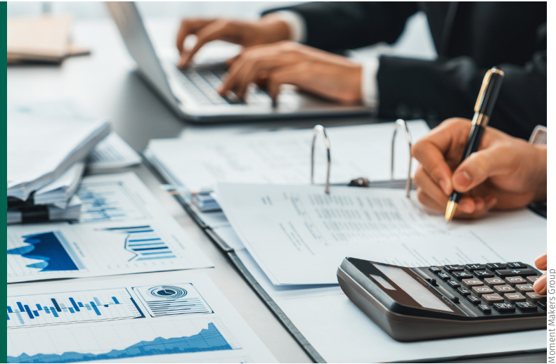
Moment Makers Group